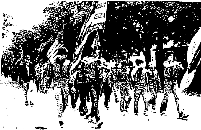
Duxbury Boy Scouts, followed by Cub Scouts, with flag bearers in lead.